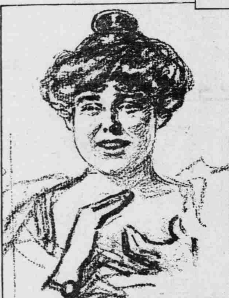
The college girl who thinks everything is perfectly corking, and as for the leading man—"My dear, he's simply great-o!"