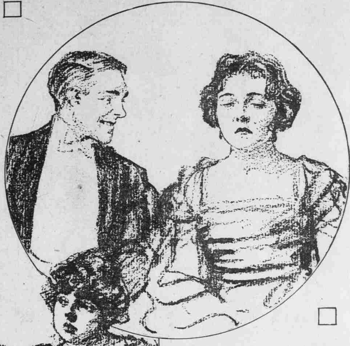
Debutante who has been to the show four times with other theatre parties sitting next to the wrong man, who insists on repeating all the jokes for her benefit.