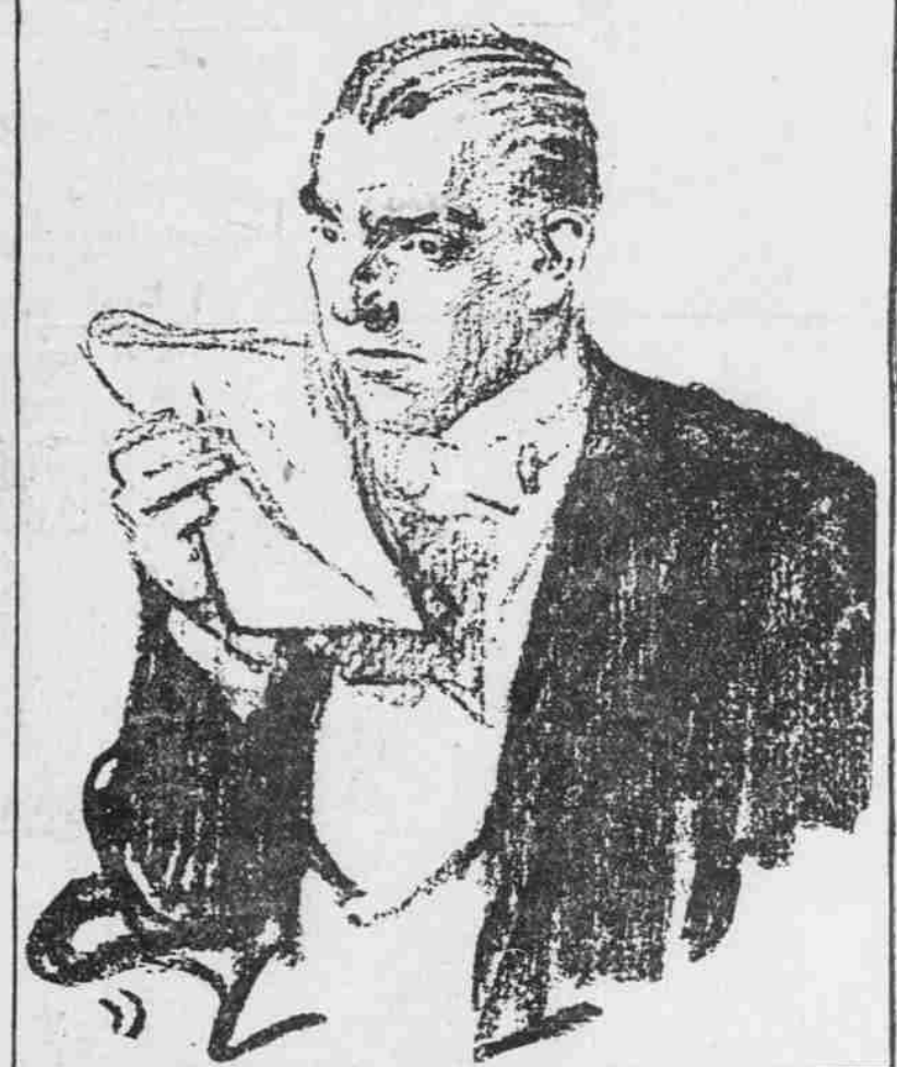
The man who knows the second show lady from the end of the line and doesn't dare look at the stage overmuch.