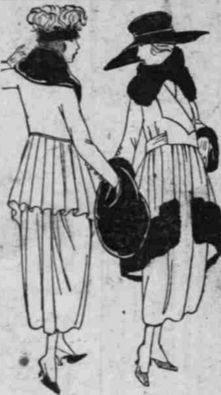
Garment Store Second Floor

Second Floor—Beautiful garments made up in silk velvets, chiffon, broadcloth, plush, Bolivia, etc. Very latest belted styles with fancy linings. Note the sale prices below: —$37.50 Coats now $28.50 —$110.00 Coats for $72.50 —$45.00 Coats now $39.65 —$125.00 Coats for $83.75 —$87.50 Coats now $55.00 —$135.00 Coats for $85.00 —$98.50 Coats now $62.50 —$200.00 Coats $125.00