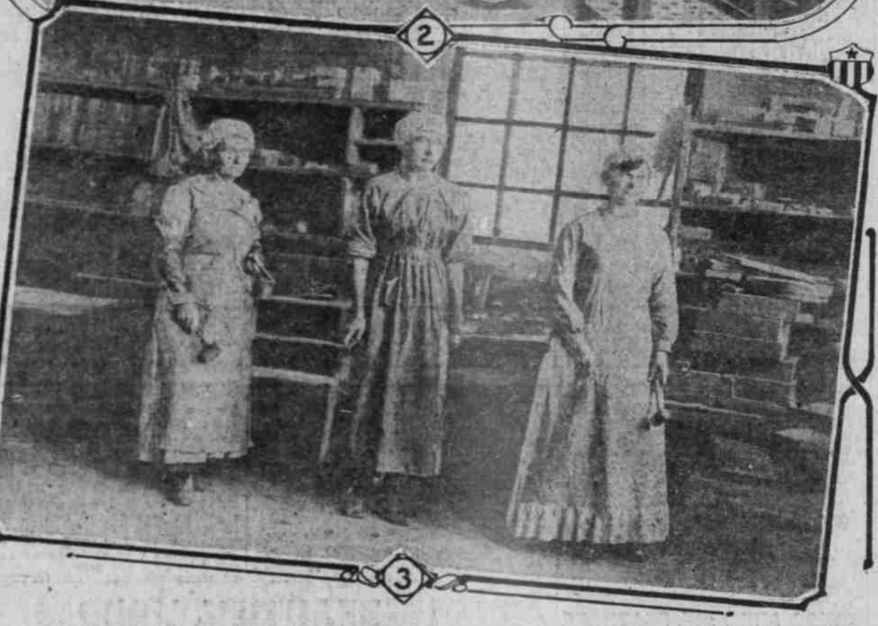
1—Women Employes in Coach-Cleaning Department at Portland. 2—Women Brass Polishers in Company Shops at Albina. 3—Coremakers in Foundry at Albina Shops.