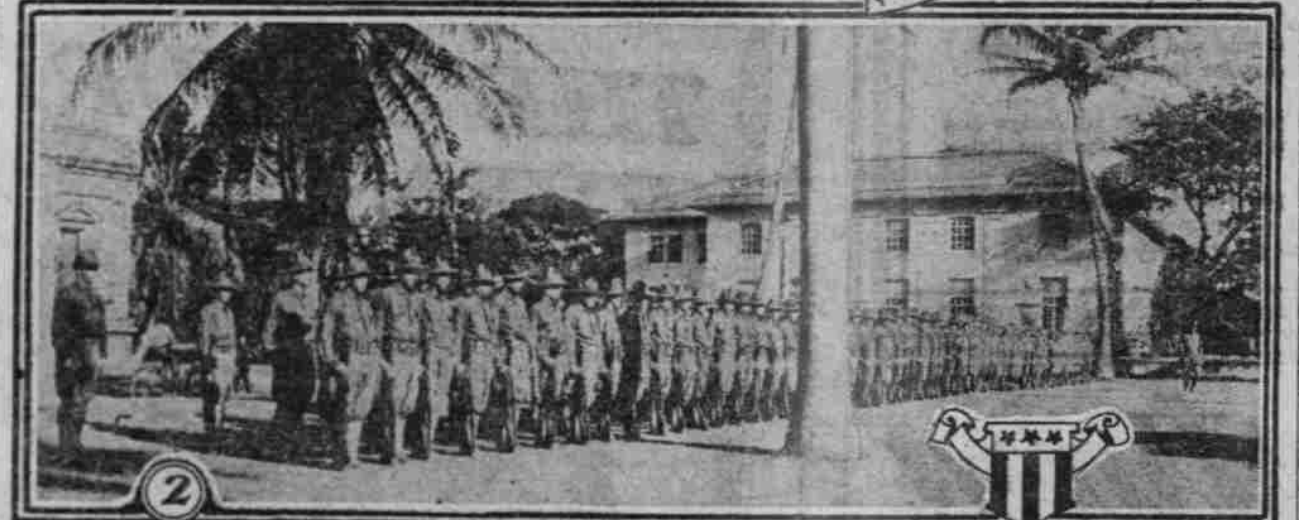
1—OFFICERS OF THE REGULAR ARMY DRILLING RECRUITS. 2—COMPANY OF SLANT-EYED TROOPS LINES UP FOR INSPECTION.