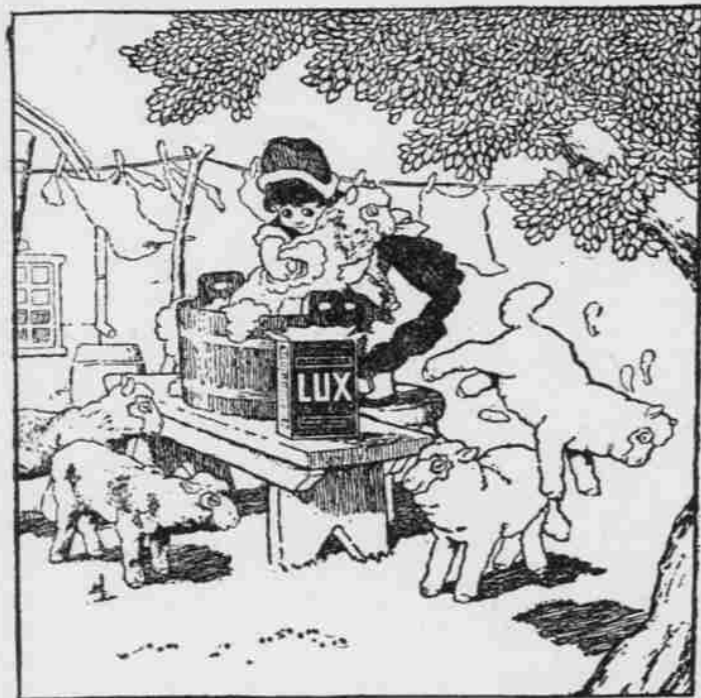
Lux positively won't shrink woolens. It leaves your sweaters, blankets, crocheted articles, all your woolens, just as they were when new!

dirt and cleans perfectly without rubbing. These flakes won't hurt any fiber, whether cotton, silk or wool! Can't injure anything that pure water alone won't injure. Order a package today and make some of the tests shown below. That is the way to settle for all time the product you will use for all fine laundering.