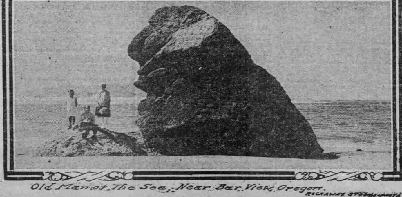
Old Man of the Sea, Near Bar, Vicks, Oregon.