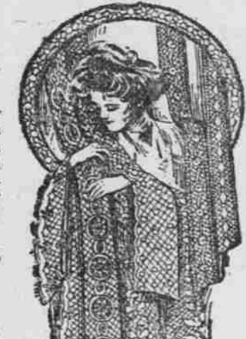
Trimming Dept. Main Floor.

Main Floor—This special half-price sale takes in our entire stock of Women's Drape Veils in circular, square and oblong styles. Plain and fancy meshes with woven and chenille borders. Black with colored and metal embroidered designs. Large variety of styles to select from. All on sale now at 1/2 price. —Regular 65c Drape Veils at 33c —Regular 75c Drape Veils at 38c —Regular $1.25 Drape Veils 63c —Regular $2.00 Drape Veils $1.00 —Regular $2.75 Drape Veils $1.38