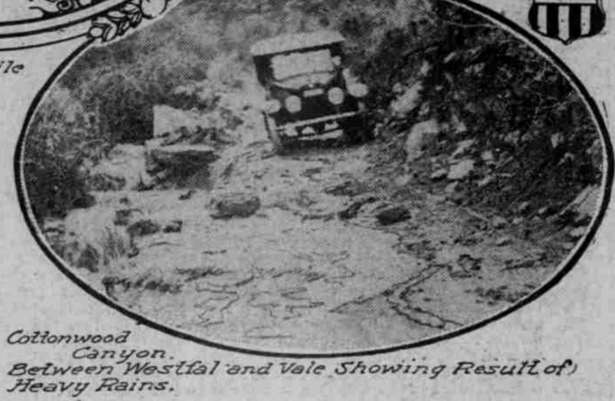
Cottonwood Canyon Between Westfall and Vale Showing Result of Heavy Rains.