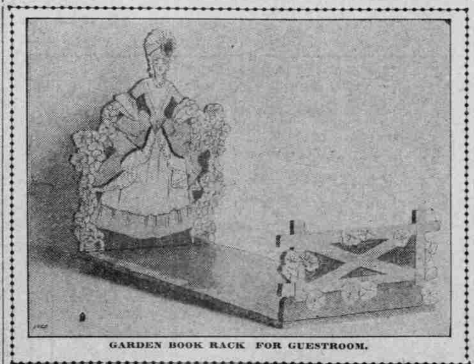
GARDEN BOOK RACK FOR GUESTROOM. MISTRESS MARY, quite contrary, how does your garden grow?

Morning Glories, Grass Path, Trellis and Vine-Covered Gate Are Prettily Tinted in Natural Effect—Conception Is Pleasing.