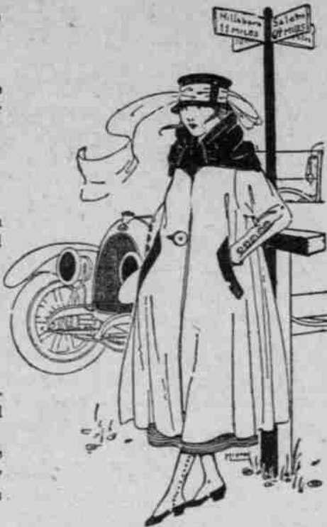
—Apparel Shop, Fourth Floor.

COATS of soft velours and hard-surfaced twills and gabardines are all smart. One striking model is full and cape-like in line—of light tan gabardine—with large black shawl-like collar, gathered to give a narrow, sloping line to the shoulders. The sleeves are quite tight up to the elbow and are outlined with a row of smoked pearl buttons. A distinctively smart model. Sports coats in endless variety priced from $12.50 to $75.