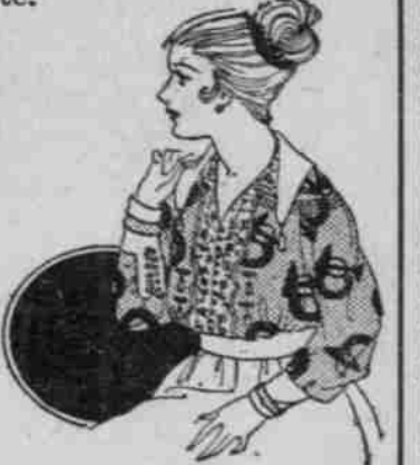
—Blouse Shop, Fourth Floor.