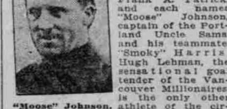
'Moose' Johnson, Ton's choice as goal; Lester Patrick of Spokane, and 'Moose' Johnson, of Portland, and Lester Patrick, of Spokane.

VANCOUVER, B. C., Feb. 17.—(Special.)—Two Portlanders have been placed on the all-star teams of the Pacific Coast Ice Hockey Association for the 1916-17 season by the three officials of the circuit.