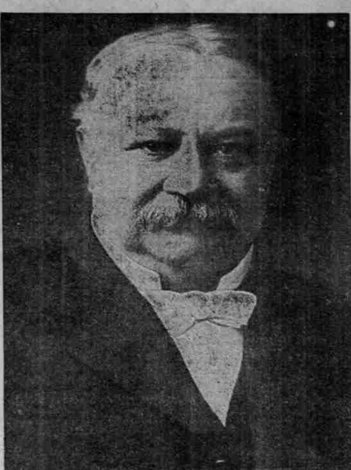
Former United States Senator Wm. E. Mason, recently elected Member of the U. S. Congress from Illinois.