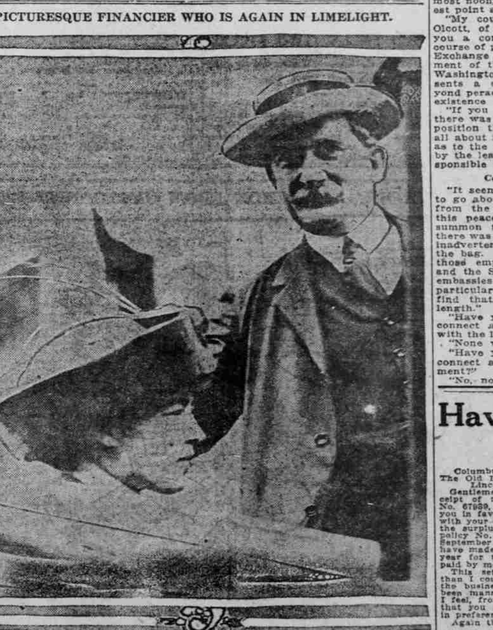
THOMAS W. LAWSON AND HIS DAUGHTER, MARIE.