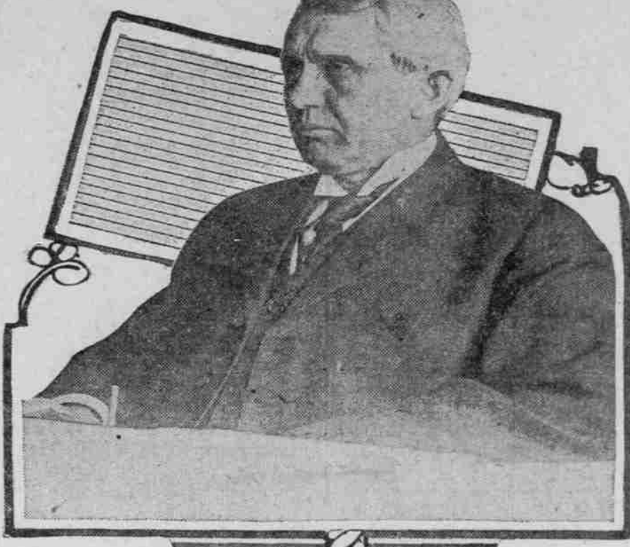
FRANK B. KELLOGG (REP.).

The new Senator from Minnesota is Frank B. Kellogg, prominent lawyer. He was the special counsel under a past Administration in the prosecution of trusts and earned at that time the name of "trust-buster."