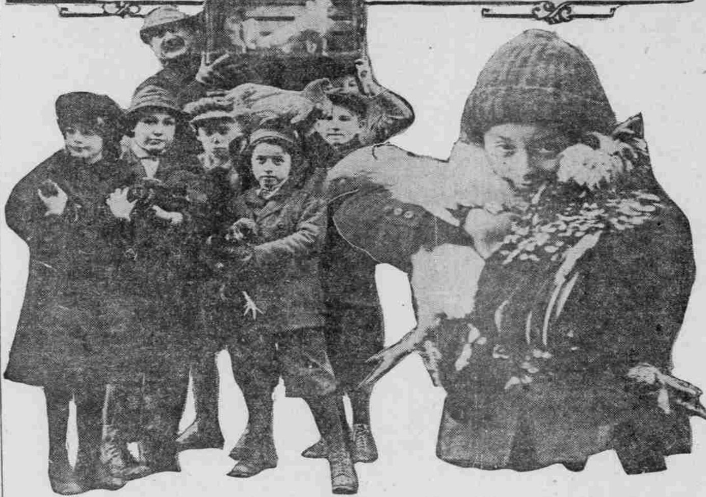
Three Views Showing Boys and Girls of Manual Training Department of the Public Schools, Who Are to Compete in Their Department of the Show.