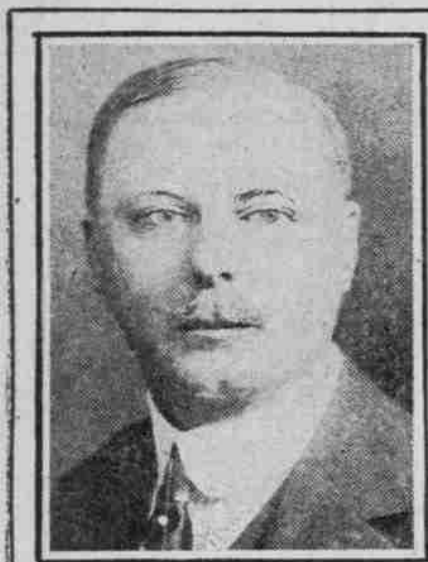
Sir Horace Rumbold