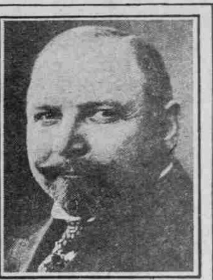
C. Th. Zahle