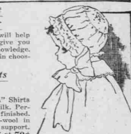
Infants' Dept. 2d Floor

These Dresses are all well made and the materials are of good quality.