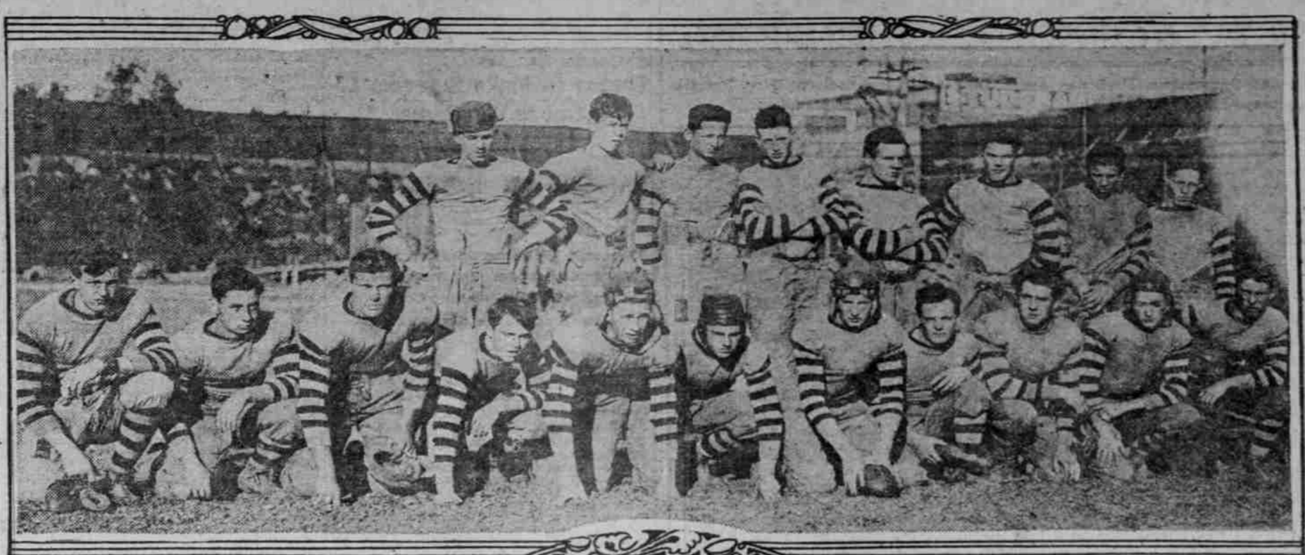
Franklin High School Football Team