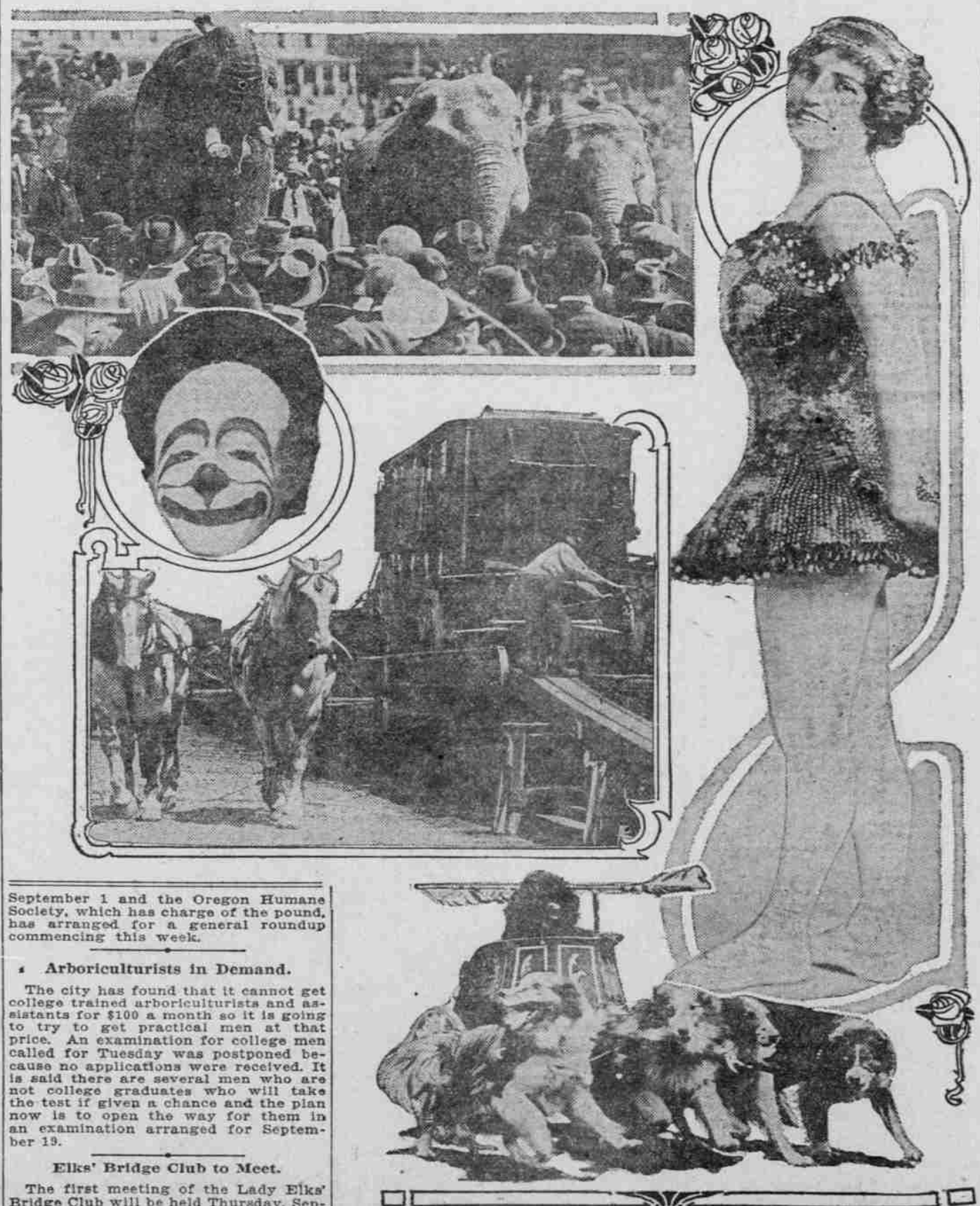
TYPICAL STARS OF THE BARNUM & BAILEY SHOW.