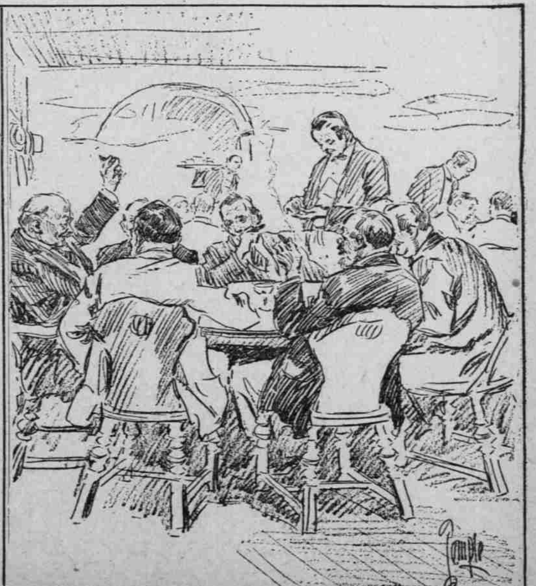
Noon Business Meeting