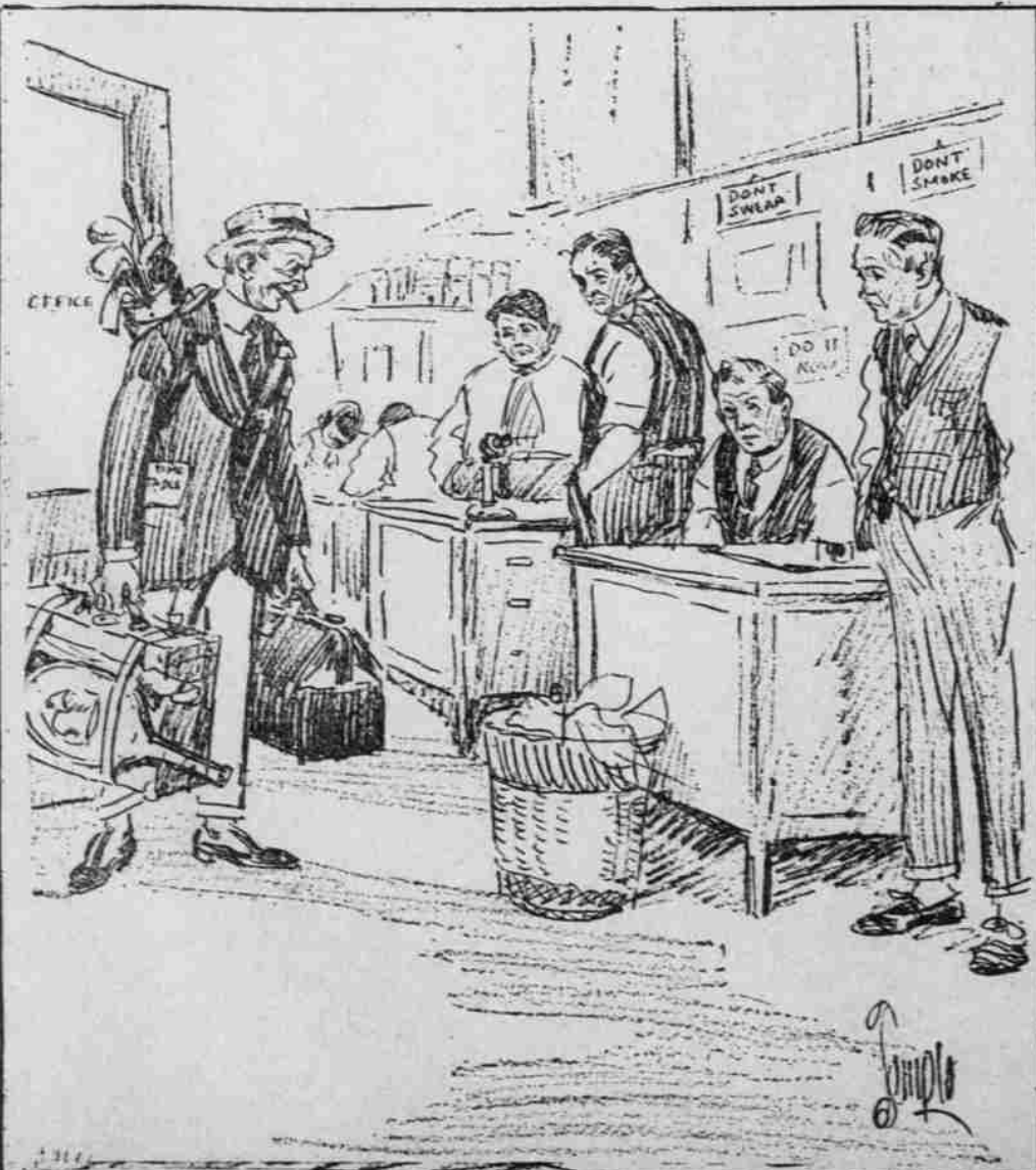
"'by Fellows, See You in Two Weeks'"