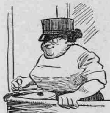
"Over in Germany Women is Running the Street Cars."

like all the others. The politician or statesman which has it may look politically healthy for a while, but sooner or later it will get the most promising career, Birsky, the same as militarism will. Take the Kaiser, and several years ago when he begun to have it, he also felt pretty good. In his case the first symptom was that he broke out all over in uniforms and he got himself appointed honorary colonel of so many regiments, domestic and foreign, that if he wore the uniforms in rotation, Birsky, he didn't get round to the same suit of clothes once in 25 years. It used to cost him a fortune for mothballs alone, and when he took off a pair of pants he sent it round to the tailor and had a V put in the back against the time when he was going to wear 'em again. However, Birsky, he soon got tired of admiration, and it didn't make no difference that his wife tried to get him to take a fresh interest by saying: 'Turn round and let me see the back. I think that peplin effect of the 842d Regiment Lippe-Schaumburg National