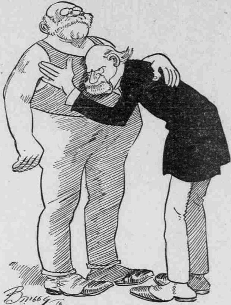
"THEY SOUND HIM FOR CAPITALISM."

"Tell me, Birsky," Zapp said, "what are you driving into?" "I am driving into this, Zapp," Birsky said. "If all that Stuss is Americanism when Mr. Wilson and Mr. Hughes says it, what is it when the Kaiser says it?" "Germanism," Zapp replied. "Then that settles it," Birsky concluded. "It ain't an ism, it's an itis, and the sooner Mr. Wilson and Mr. Hughes gets cured of it the better. Am I right or wrong?"