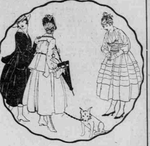
—Apparel Shop, Fourth Floor.

—At the very height of the taffeta silk suit season, our newest models in black, navy, brown, checks and stripes at these splendid reductions. Good range of sizes and excellent garments. $27.50 to $32.50 Suits Reduced to $19.45 | $42.50 to $48.50 Suits Reduced to $29.85 | $35.00 to $39.50 Suits Reduced to $24.45 | $52.50 to $65.00 Suits Reduced to $39.50