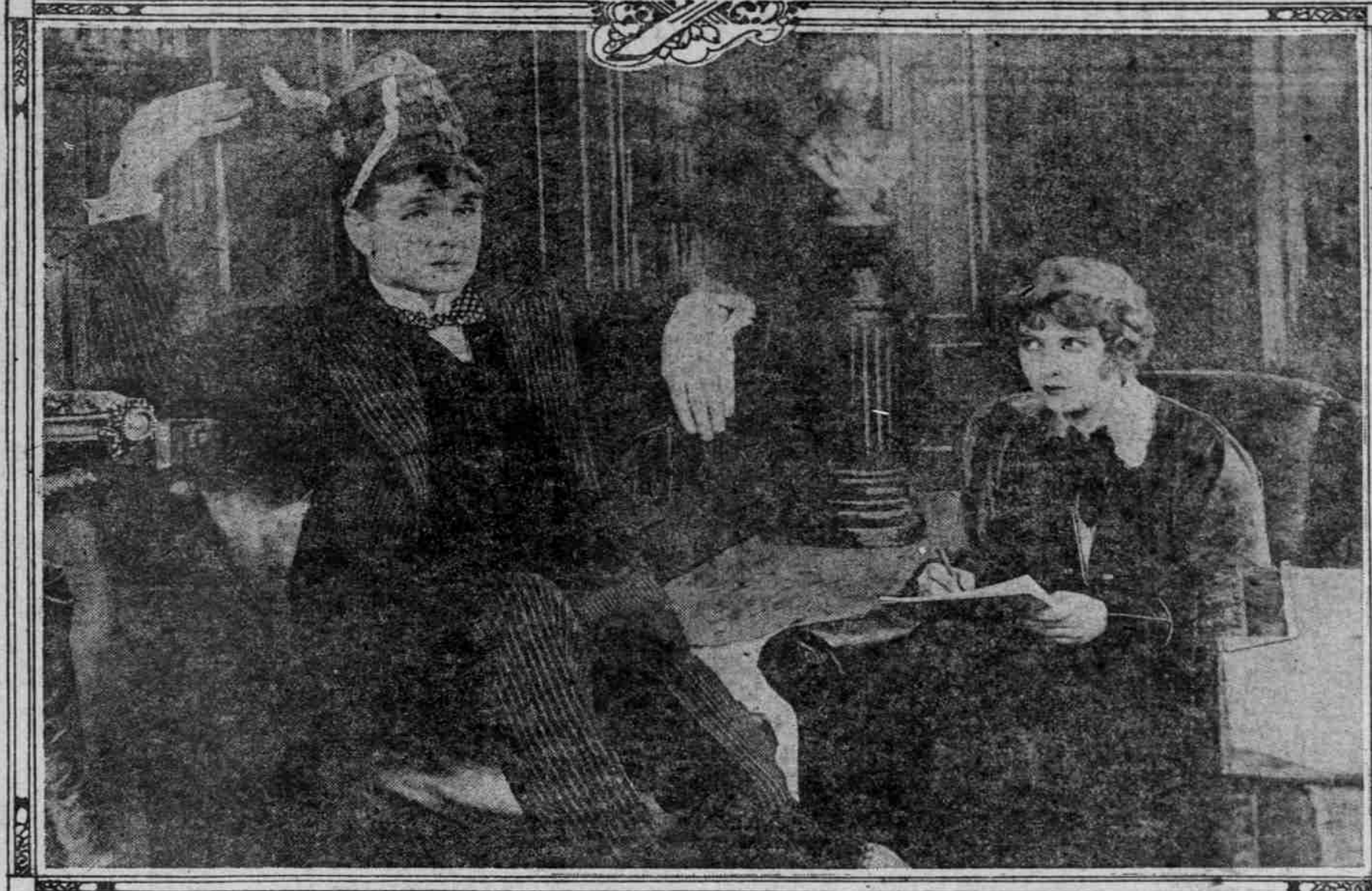
In the House of Golden There Were Few Moments When Margory Could Relax Legar's Latest Plot Was Even Then About to Crash Upon the Household.

A strange, masked figure enters into the struggle, and the butler escapes. Manley and the other opponent retreat to the bottom of the stairs. The stranger escapes. Manley, convinced the stranger is none other than the Count, in non-placed to see the nobleman walk coolly into the room. Manley declares to Golden and Margory: "He is merely the guy who put the laugh in Laughing Mask."