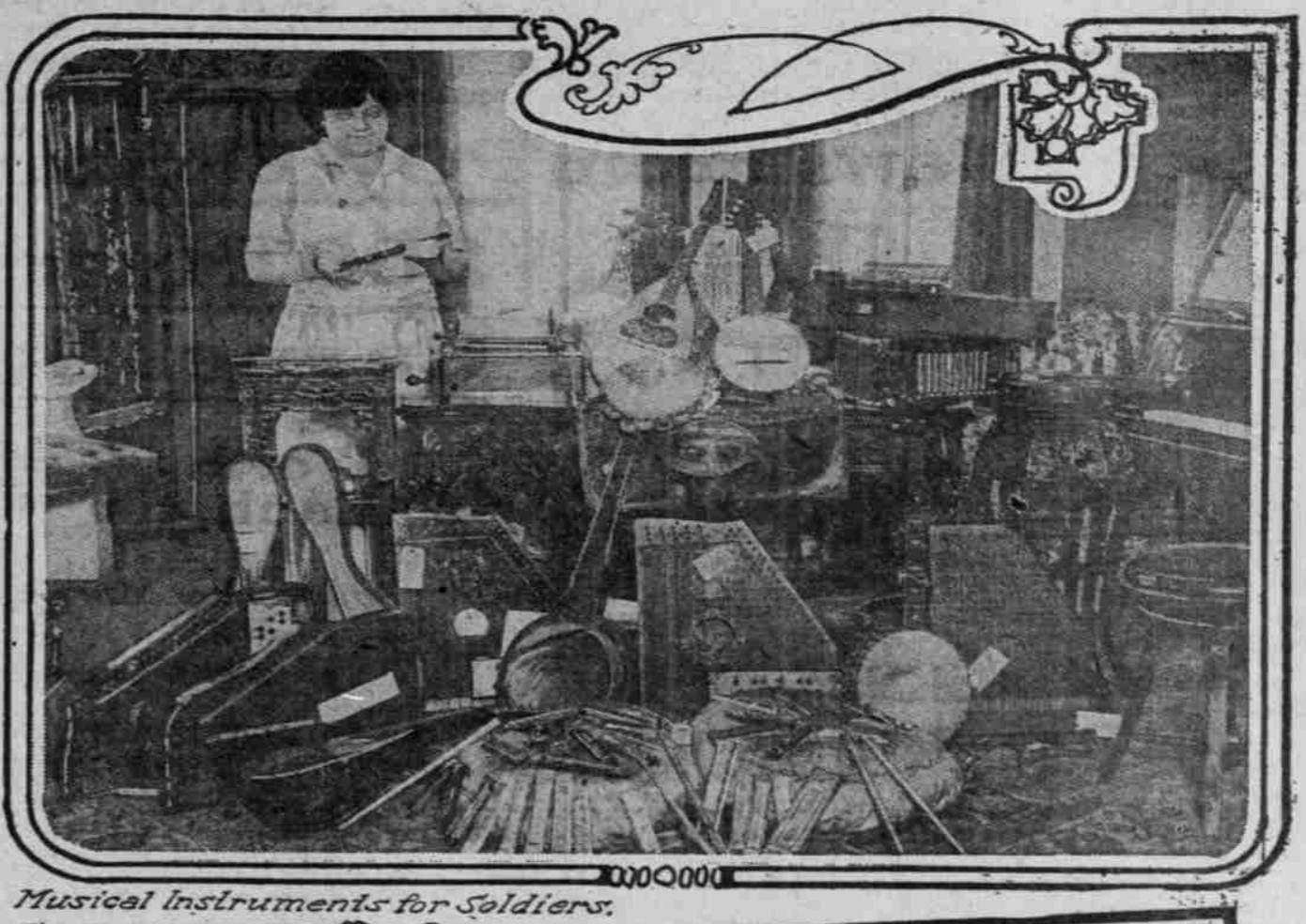
Musical Instruments for Soldiers.