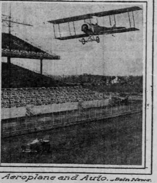
Aeroplane and Auto.