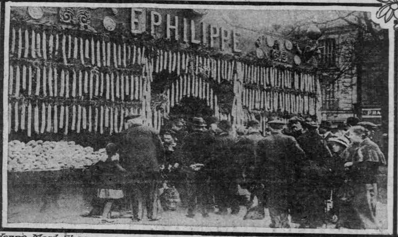
Horse Meat Shop in Paris.