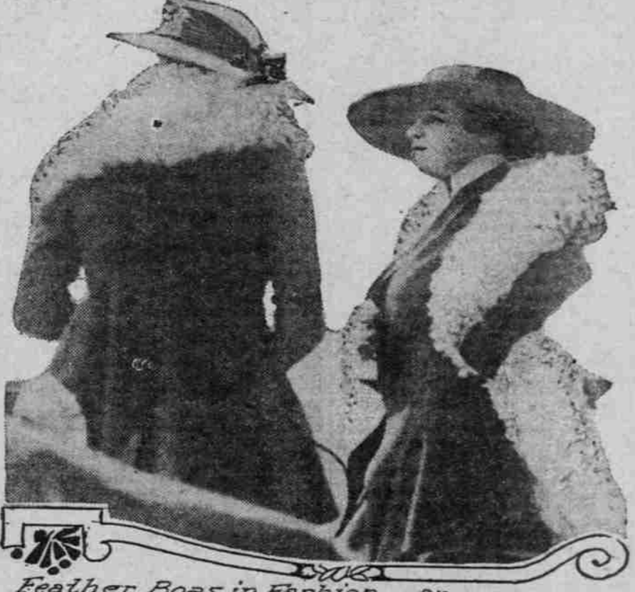
Feather Boas in Fashion

The National service camp at Chevy Chase is now in full swing. Drills are given by an officer of the Army and