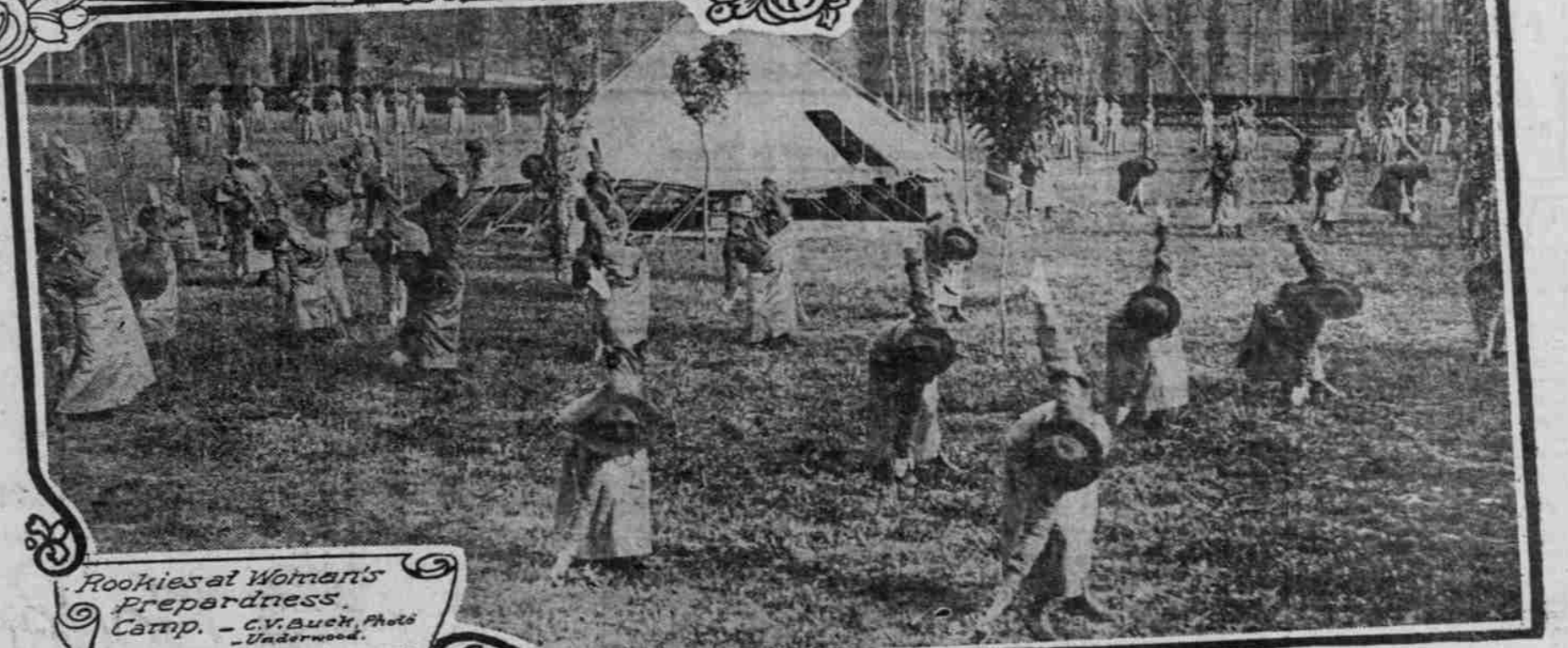
Rookies at Woman's Preparedness Camp.