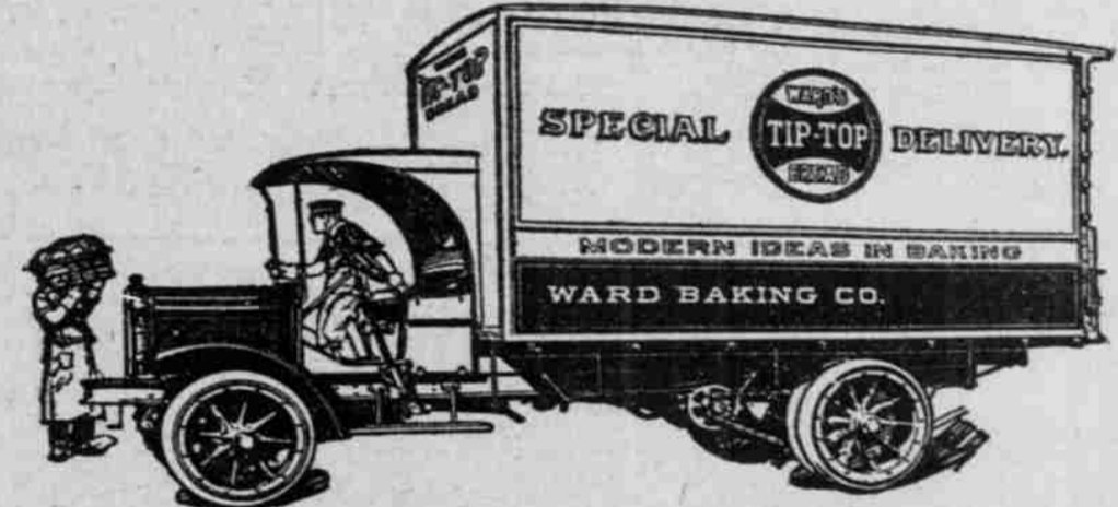
The Ward Baking Company owns a total of 43 White Trucks

typically 3,000,000 automobiles, with the probability that this number will be increased to 5,000,000 before the close of the present selling season."