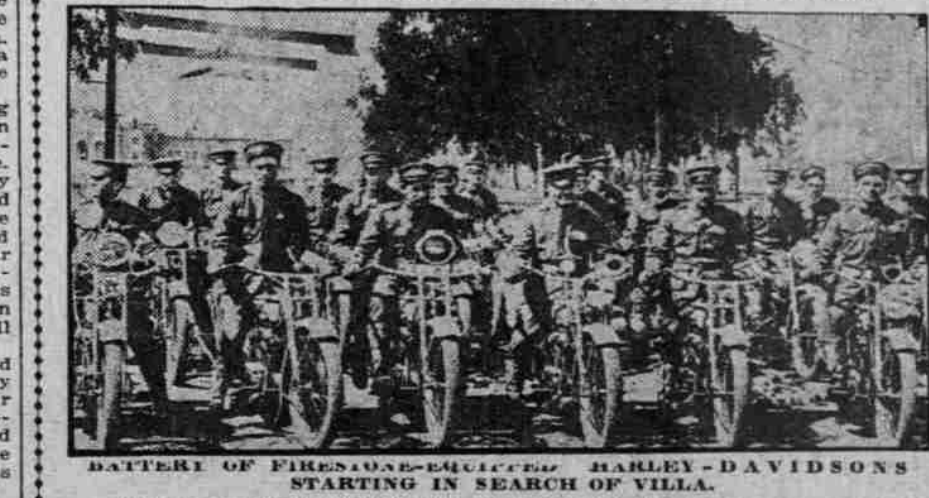
UNCLE SAM'S MEN RIDE TO MEXICO ON MOTOR BIKES. BATTERY OF FIRESTONE-EQUIPPED HARLEY-DAVIDSONS STARTING IN SEARCH OF VILLA.