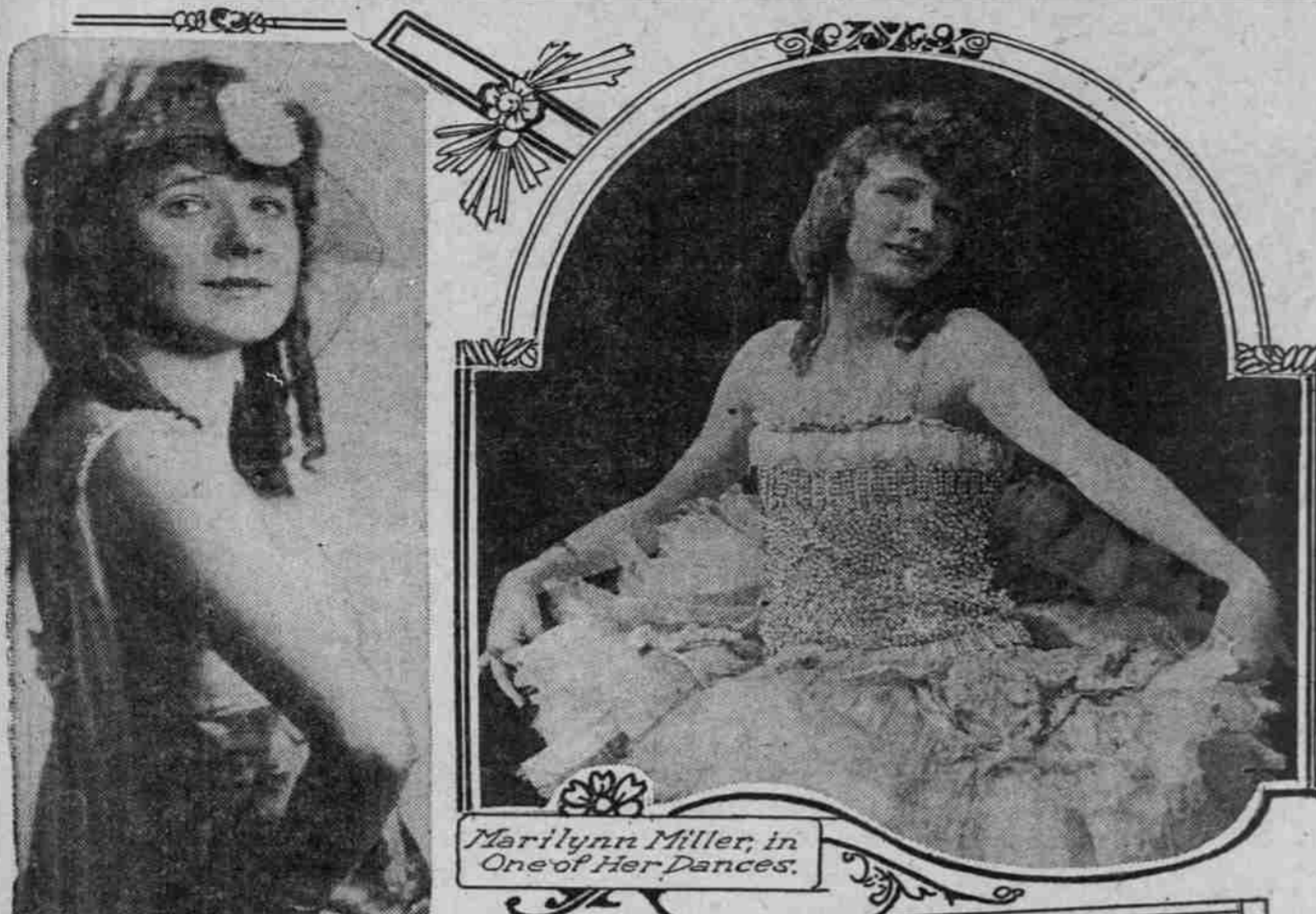
Marilynn Miller, in One of Her Dances.

Hebrew Comedians, Who Fill In Own Lines From Personal Study of Character Parts, Will Appear Here—Miss Marilynn Miller, Only 17, Is Clever Follower of Terpsichore and Is Adept at Impersonations.