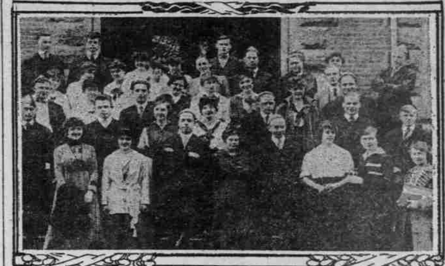
Freshman Class of Pacific University

PARTICIPANTS IN PICNIC GIVEN BY PACIFIC UNIVERSITY STUDENTS TO SENIORS OF WASHINGTON COUNTY HIGH SCHOOLS LAST WEEK.