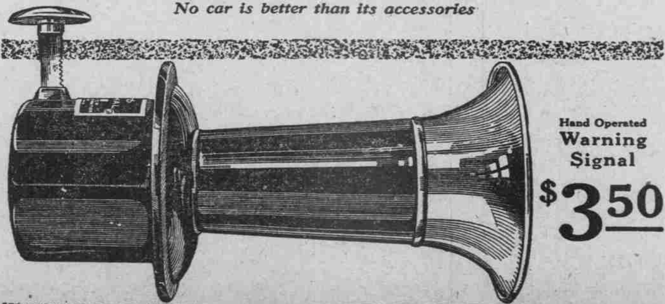
Hand Operated Warning Signal $3.50