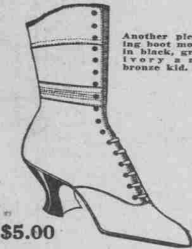
Another pleasing boot model in black, gray, ivory, and bronze kid.