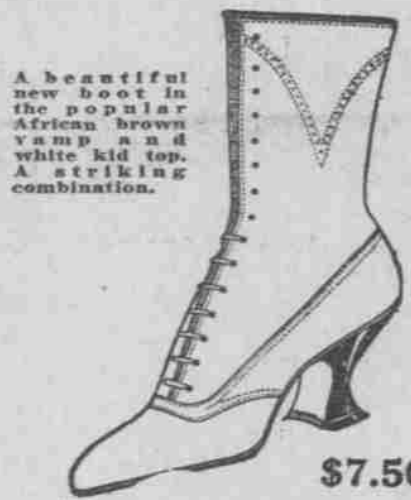
A beautiful new boot in the popular African brown vamp and white kid top. A striking combination.

Same Except French Bronze...$7.00 Dull Kid.....$6.50 Medium light shade gray ooze $6.50