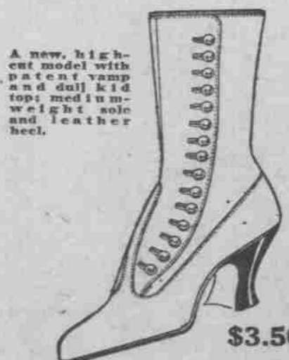
A new, highest model with patent vamp and dull kid top; medium-weight sole and leather heel.