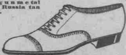
New Model Oxford for men—English last. In gun metal and Russia tan calf.