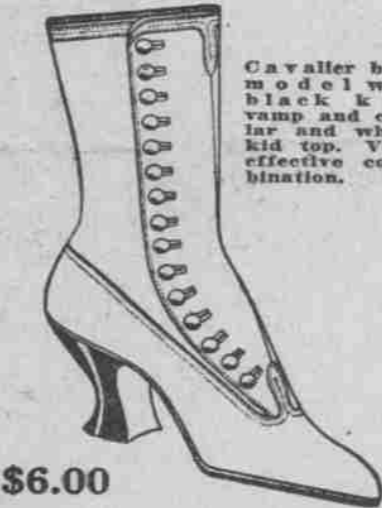
Cavalier boot model with black kid vamp and collar and white kid top. Very effective combination.