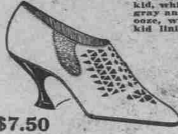
A delightful new pattern. Open-work pump in black, bronze, ivory kid, white calf, gray and black ooze, with full kid linings.