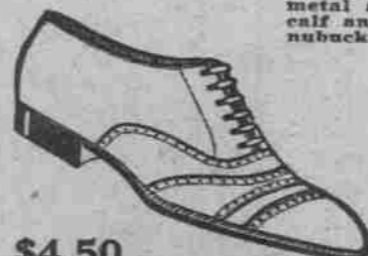
A Classy New Oxford for men in gun metal and tan calf and white nubuck.