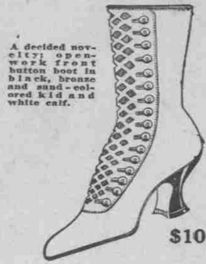
A decided novelty; open-work front button boot in black, bronze and sand-colored kid and white calf.