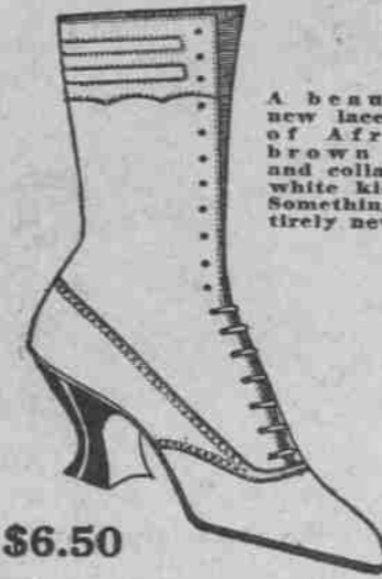
A beautiful new lace boot of African brown vamp and collar and white kid top. Something entirely new.