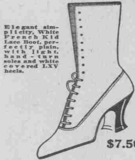
Elegant simplicity. White French Kid lace boot, perfectly plain, with light hand-turned soles and white covered L.V. heels.