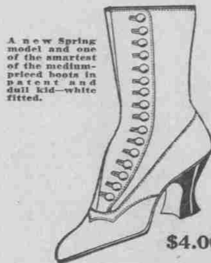
A new Spring model and one of the smartest of the medium-priced boots in patent and dull kid—white fitted.

In all bronze kid.....$7.00 In all gray suede.....$6.50 In all brown suede.....$6.50