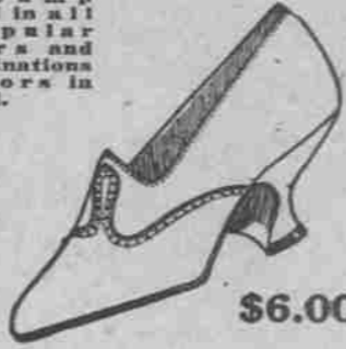
A beautiful new pump model in all the popular colors and combinations of colors in soft kid.