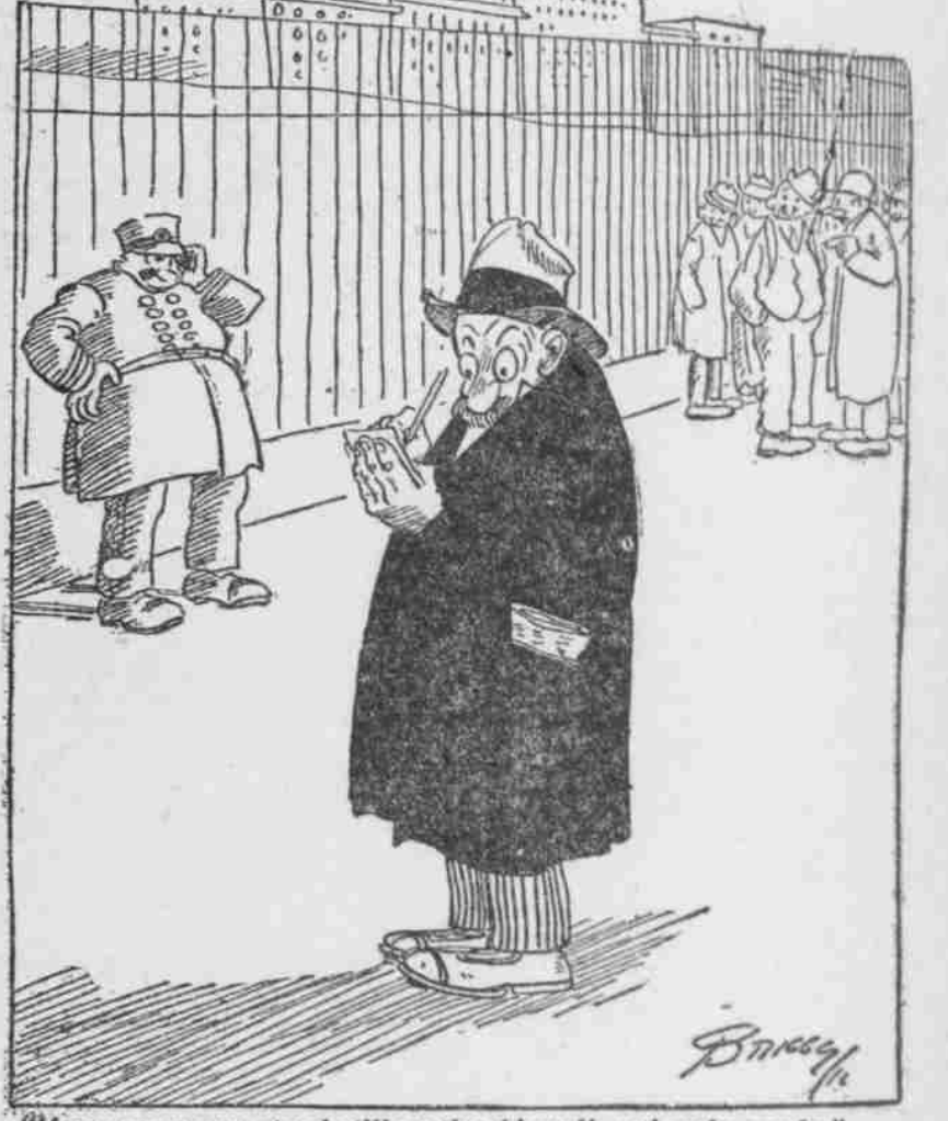
If you see a man stand still on the sidewalk and make marks.

"Well, why not?" Birsky retorted. "Look what a moving picture actor is got to do to earn his money. We will say, for example, that he goes to work at nine o'clock. At half past nine he goes up to Central Park and falls out of an oiternobile running thirty miles an hour. The first time he falls out, maybe the feller that works the camera wasn't looking, so he's got to fall out again. This time somebody moves the camera, so he falls out a third time, and one way or another they keep that actor falling out of an oiternobile going thirty miles an hour from half past nine to lunch time. Supposing he does get five hundred dollars a week. Is that a life? I ask you." "Just the same, it's a lot of money