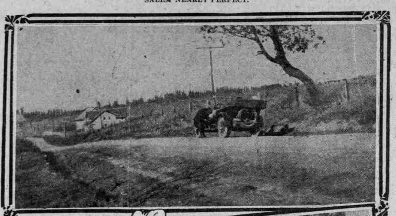
Mitchell Six of Sixteen On Typical Polk County Road Last Sunday

side route from that point in is popular. Though the bridge across the Willamette at Salem is tentatively condemned, travel is permitted and rendered reasonably safe by limiting the number of vehicles that can pass at one time. Immediately after crossing this bridge the Mitchell was steered to the right and driven on past the Wallace ranch to a crossroad where signs reported that we had gone a distance of 2 1/2 miles from Salem, that Hopewell was three miles ahead and that the road along the river to the right led to Dayton, 12 miles away.