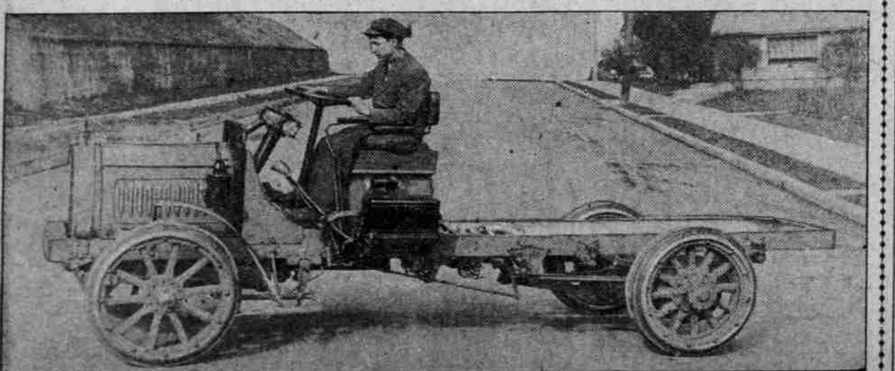
ONE-TON CHASSIS NOW BEING EXHIBITED BY FRANK C. RIGGS COMPANY.