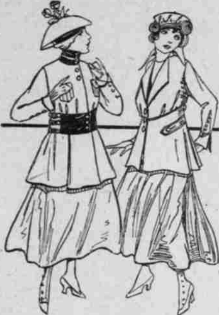
—Fourth Floor, Fifth Street

Priced $19.50, $22.50, $45.00 and $47.50