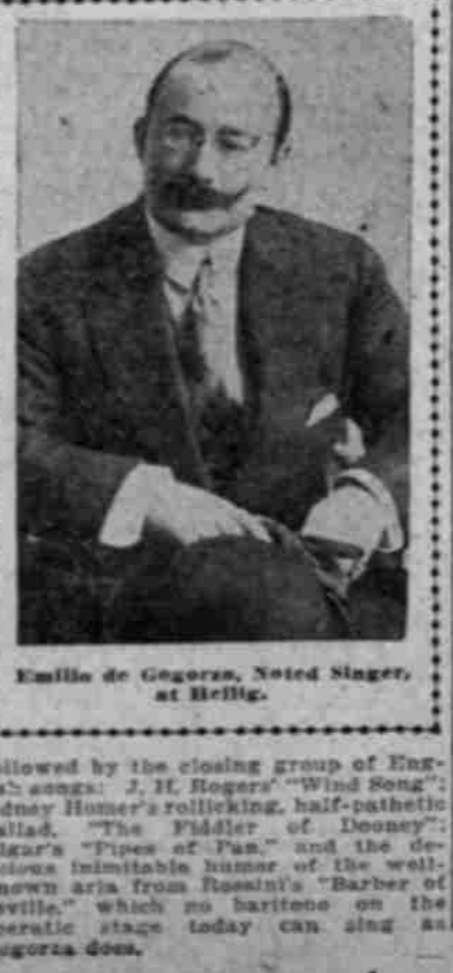
Emilio de Gogorza, Noted Singer, at Heilig.