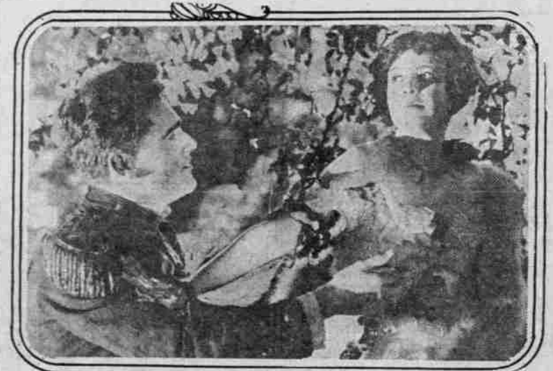
Marguerite Clark, in "Mice and Men," at Peoples.

pled as the woman who pawned the smuggling and the quarrel in the Bernard family is patched up.