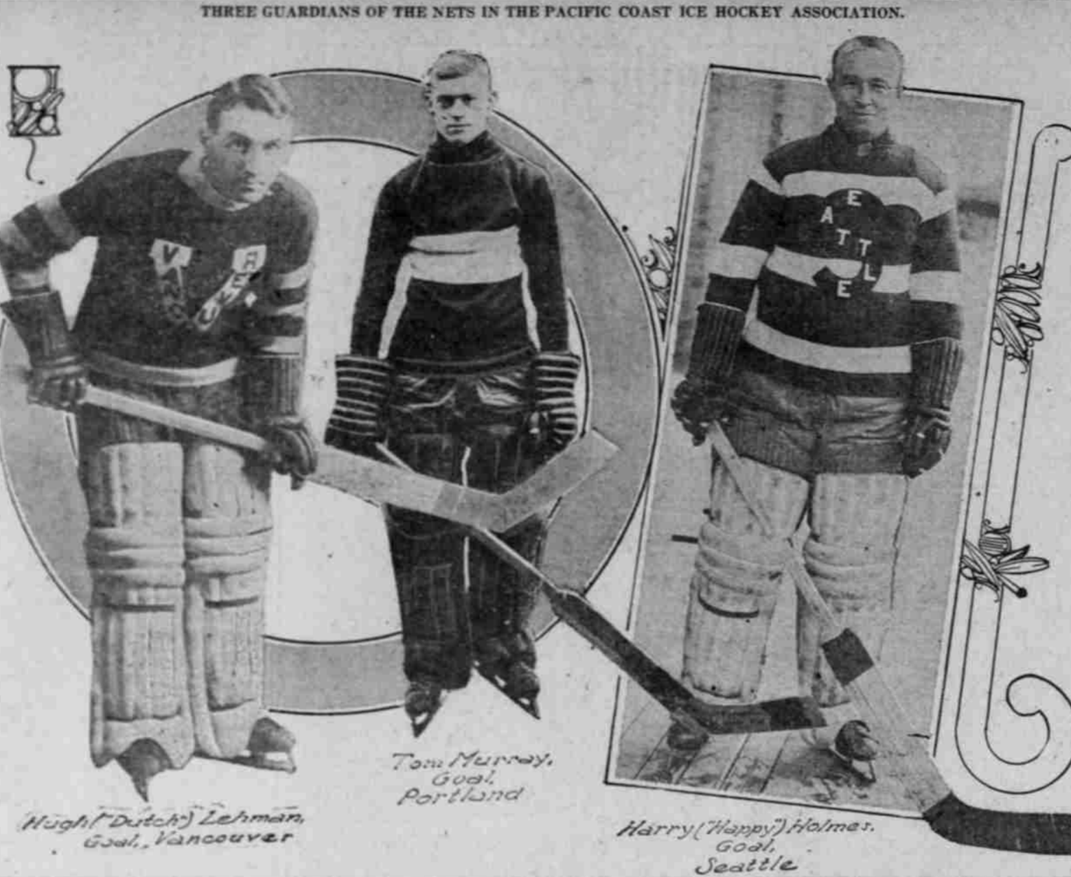
Tom Murray, Goal, Portland; Hugh (Dutch) Lehman, Goal, Vancouver; Harry (Happy) Holmes, Goal, Seattle.