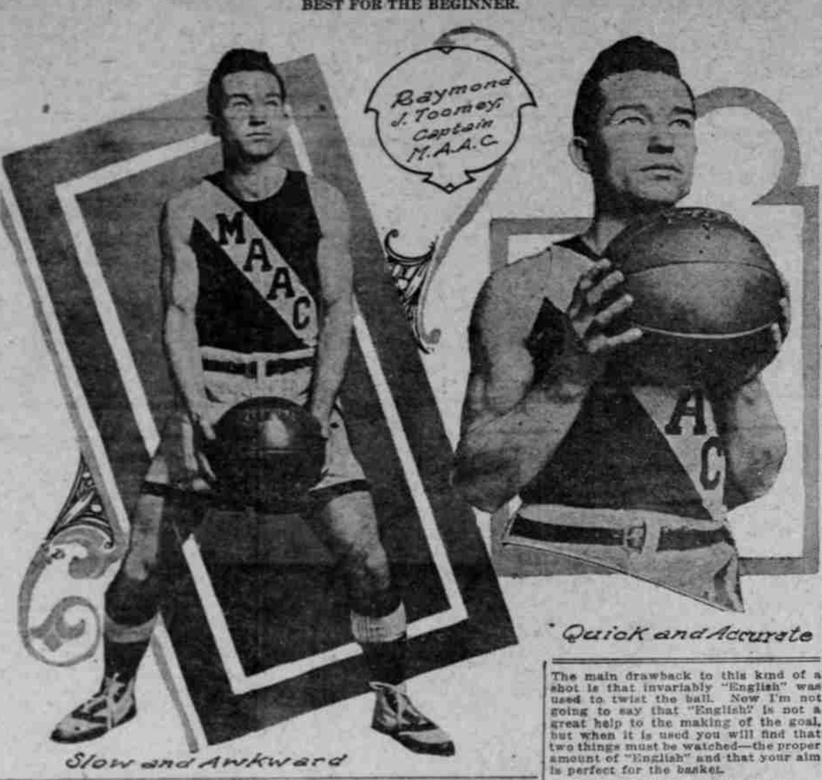
Slow and Awkward