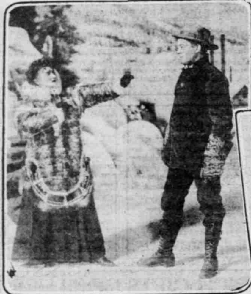
Scene from "The Spoilers" at the Baker.