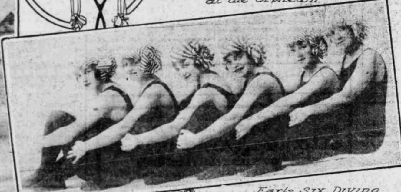
Earl's Six Diving Nymphs at the Empress.