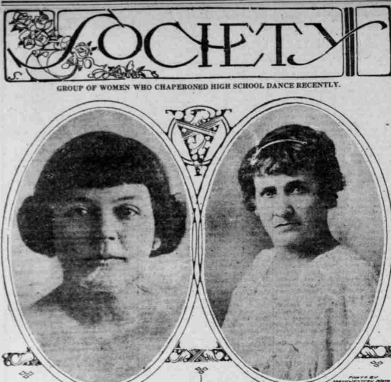
GROUP OF WOMEN WHO CHAPERONED HIGH SCHOOL DANCE RECENTLY.