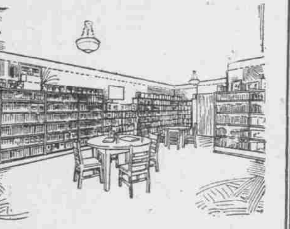
Corner in Children's Room—Balcony Floor

Give the children books for Christmas. Parents and all who love children are cordially invited to inspect the Children's Book Store—a complete library, with privacy and quiet, where you and the children can browse among books at leisure.