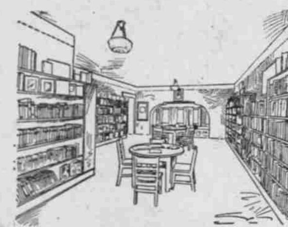
View in Children's Room—Balcony Floor

A good book is the child's best teacher! Books arouse and encourage higher ideals and inspire imagination and noble thought. The greatest minds—the cleverest writers—the most thorough teachers have contributed their best efforts in better books for children. In good reading the child absorbs those sentiments and ideals which parents and teachers find difficult to arouse.