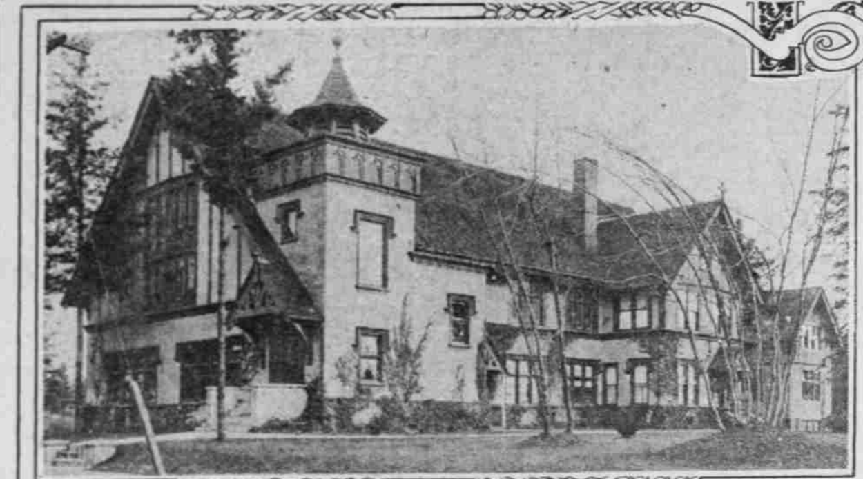
Church of the Madeleine