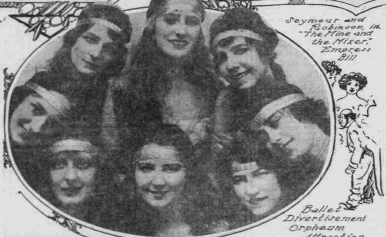
Ballet Divertissement Orpheum Attraction

ment since the San Francisco Orpheum assumed control here ten weeks ago. At the Empress "The Original Act Beautiful" is the headliner, with a big Arabian white horse and white English settees in living poses.