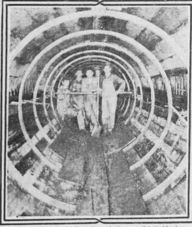
Completing New 7 Foot Trunk Sewer 50 ft Under East Alder Street At E. 1st Street.