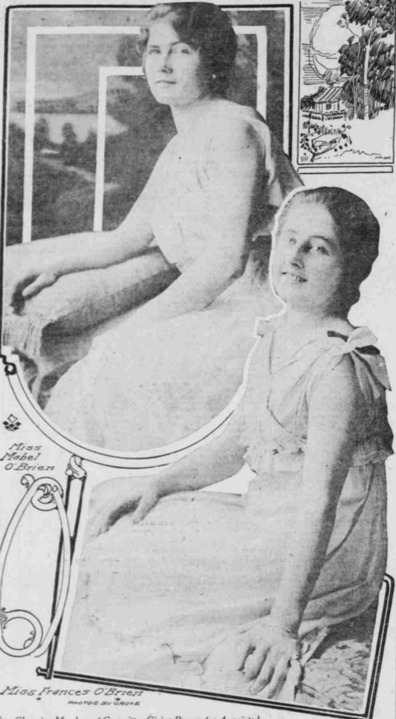
Two Charming Members of Committee Giving Bazaar for Associated Charities.