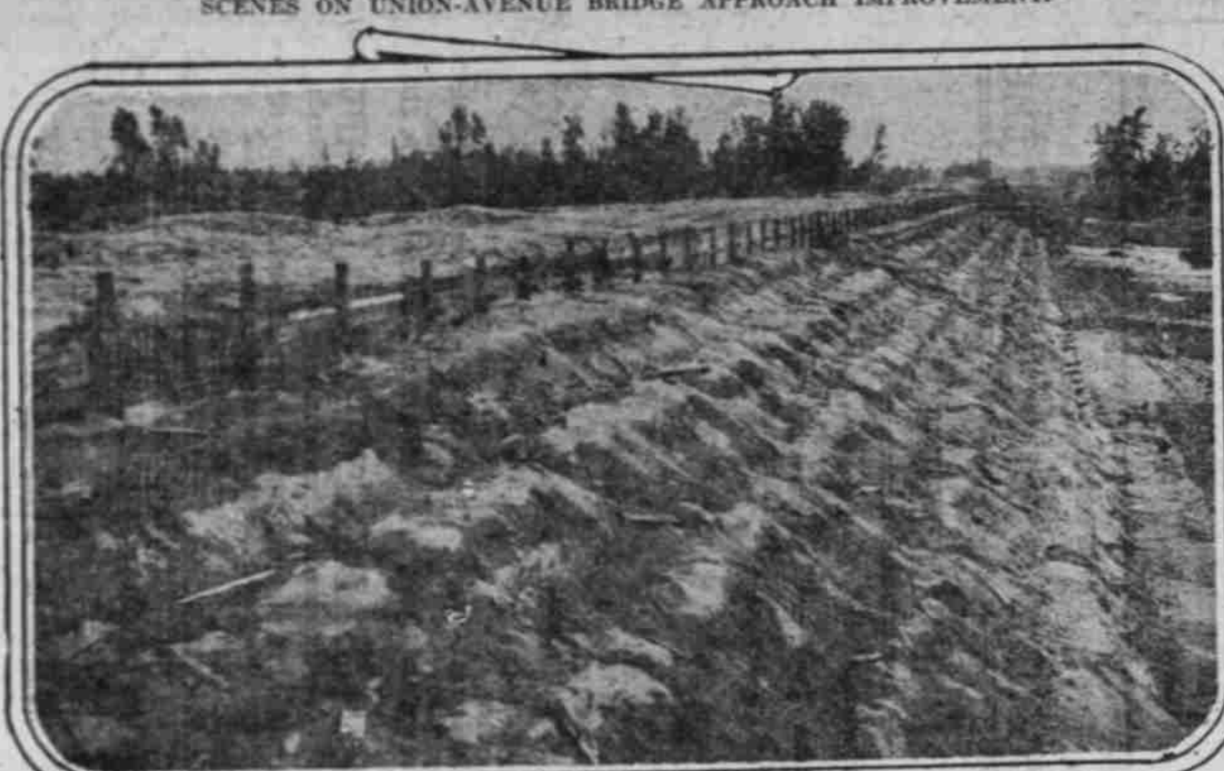
Portion of New Fill Looking South Towards Columbia Boulevard