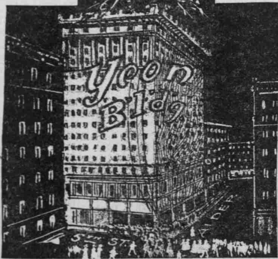
HERE IS WHERE THE SALE TAKES PLACE

Adler-Rochester, Garson-Meyer, Stratford System Clothes The World's Best