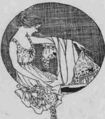
Such Pretty Dimity