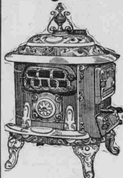
Duplex, wood and coal, 18 inches wide, cast iron duplex. Special at $15.00