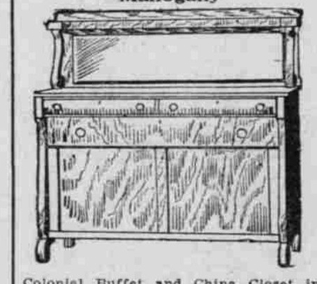
Colonial Buffet and China Closet in Choice Mahogany Veneer.