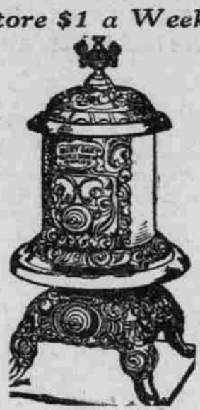
Fairy Oak Heater, 11 in. in diameter, coal or wood burner, handsomely nicked. At $6.75