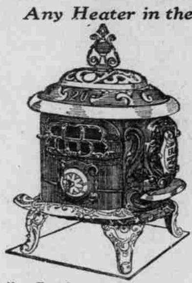
New Era, for wood; mica door, nicked top, rings, dampers and footrest, cast iron hinges. Splendidly finished and construction guaranteed. Special at $10.35