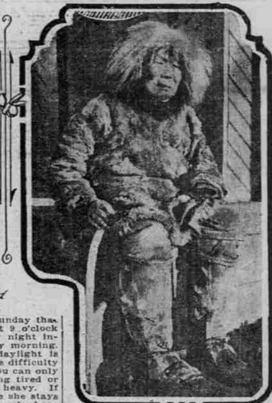
Eskimo Woman From Cape Prince of Wales.