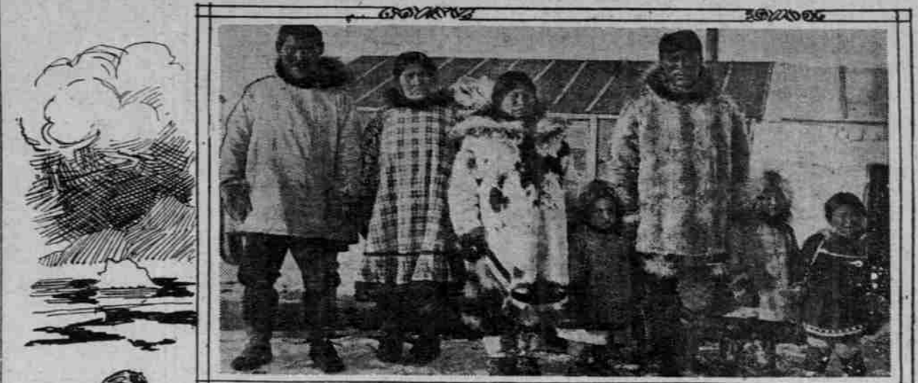
Some of the Pupils With Their Parents.