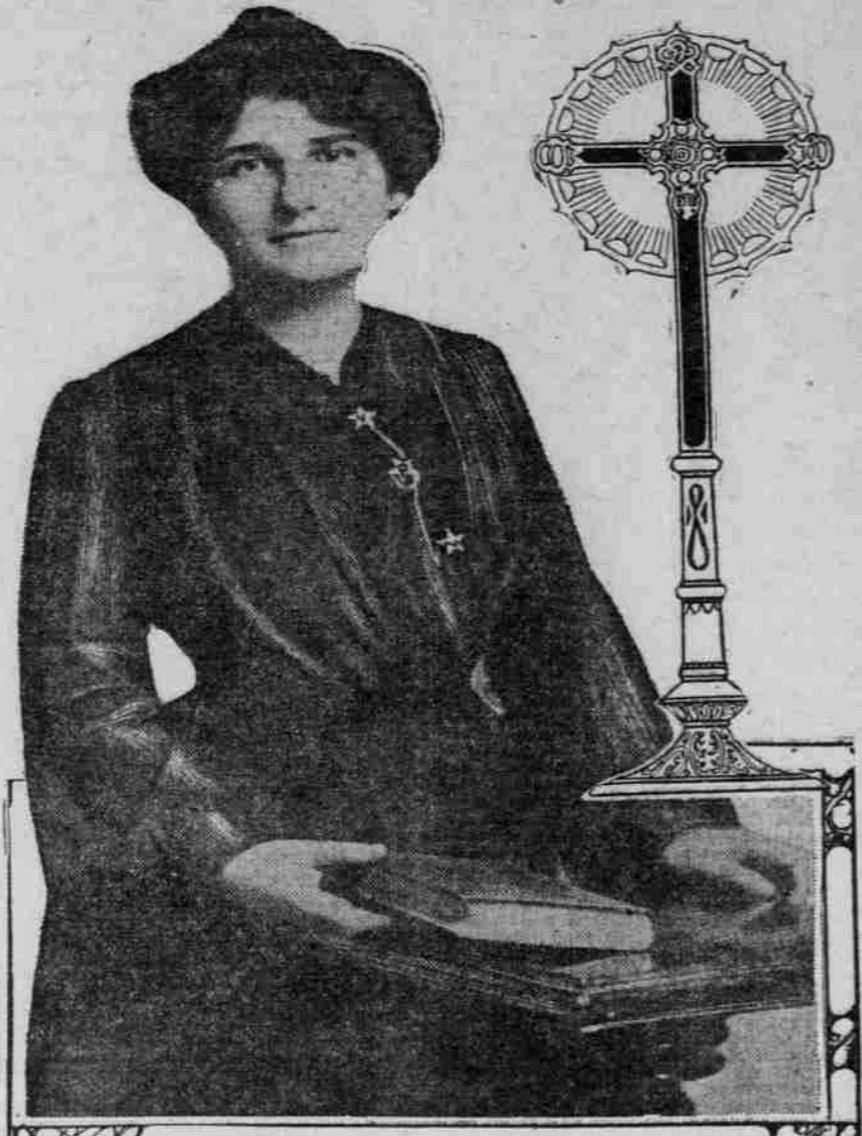
Mrs. Maud Ballington Booth