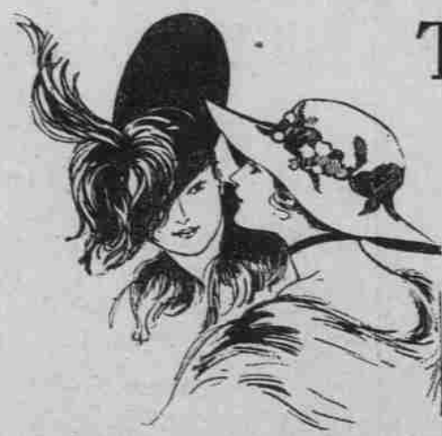
—Fourth Floor, Sixth-St. Bldg.

but your hat must have "chic." Have you seen the new "models" we've just received? One is a small Knox Hat—a toque of blue with uptilted back and trimmed with band of cut steel and blue beads. Another is a medium-sized tricorn—a Phipps hat with large bronze toque at the side—quite clever!—and a third is a large, graceful Vogue with drooping brim, slashed here and there. The only ornament is a white bird with black velvet wings—unusual! Scores of other exclusive models you ought to see.