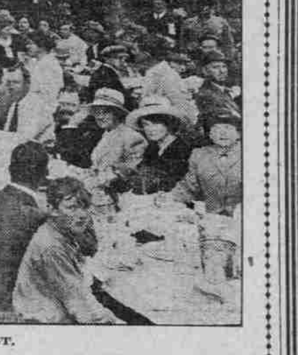
THOUSAND PEOPLE AT BARBECUED ELK FEAST.