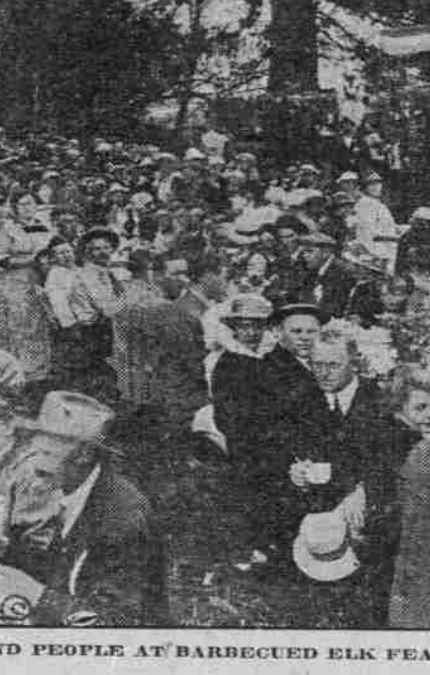
THOUSAND PEOPLE AT BARBECUED ELK FEAST.